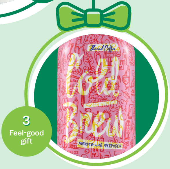
3 Feel-good gift