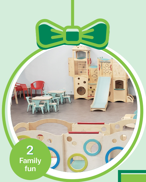
2 Family fun