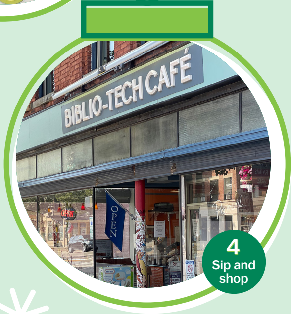
4 Sip and shop