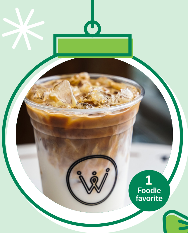
1 Foodie favorite